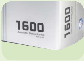
Fully automatic – Automatic Charge Control