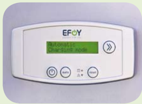
Optimally integrated – Digital remote control