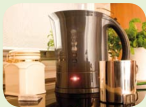
230 volt devices – no problem