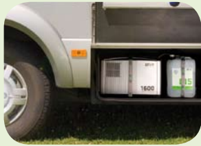
Compact – Standard Installation kit