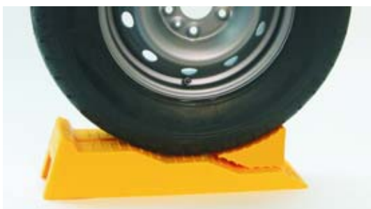
Level Up Yellow with Chock