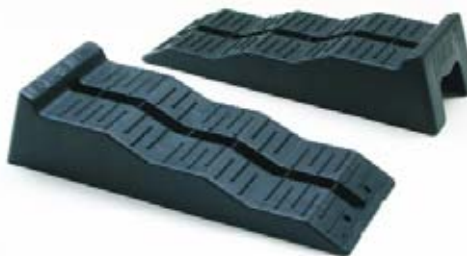
Level Up Black