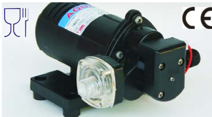
Aqua8: the perfect spare pump interchangeable with all the others

New improved self-priming pump. It will pump water vertically over 3m with no priming. Complete with Silent Kit which eliminates vibrations. The stainless steel filter prevents impurities from entering and is easily cleaned so the pump lasts longer. An automatic pressure switch starts and stops the pump by opening and closing the valve. Non-toxic materials are used for all parts of the pump that come into contact with water. The pump is resistant to limestone deposits and oxidation. Can run dry without damage. The pump can operate in any position, but we recommend installation with the motor on top and the head underneath to prevent possible damage to motor caused by leaks. Install on a solid surface to reduce noise and vibrations. Easy maintenance: all its components are easily replaced. New improved base plate with sound-absorbing feet that can be interchanged with previous pump models. Angle and straight connectors for Ø 13mm pipes standard delivered.