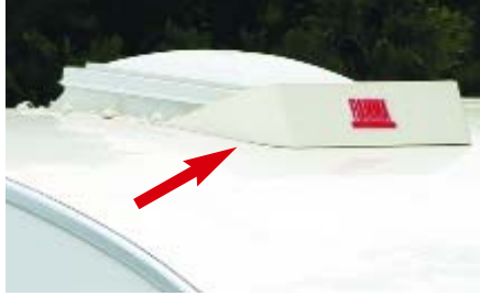
Spoiler 40x40 on Vent 40x40 White

Assists by channelling the air smoothly around your existing rooflight and thereby reducing both wind resistance and the noise levels. It is made of UV-ray resistant ABS plastic. It is easily installed with the roof vent screws or can be attached with suitable adhesives (Sika 712). Designed to fit most sizes of rooflights using the spacers included. 03585-01-